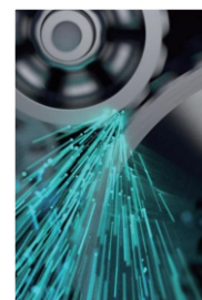
Hidden fire source search