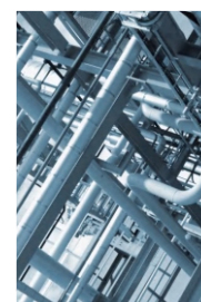
Heating equipment inspection